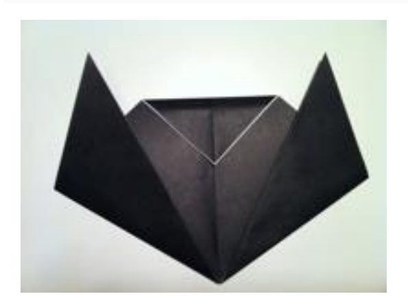
Step 6: Fold a portion of the top corner down.