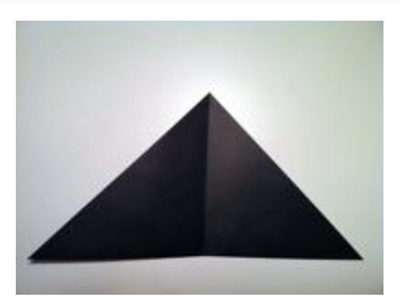
Step 4: Unfold.