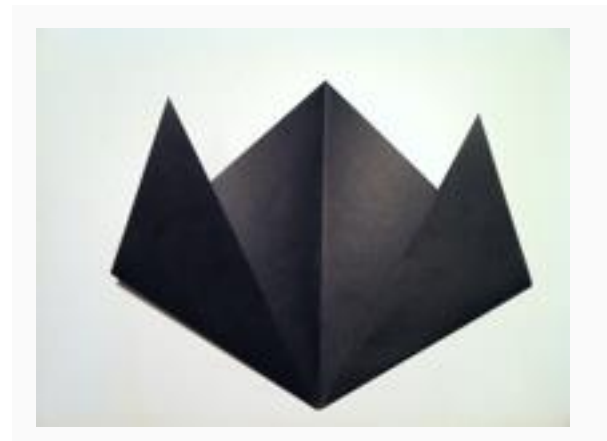
Step 5: Fold the ears up at an angle just like you see in the picture.