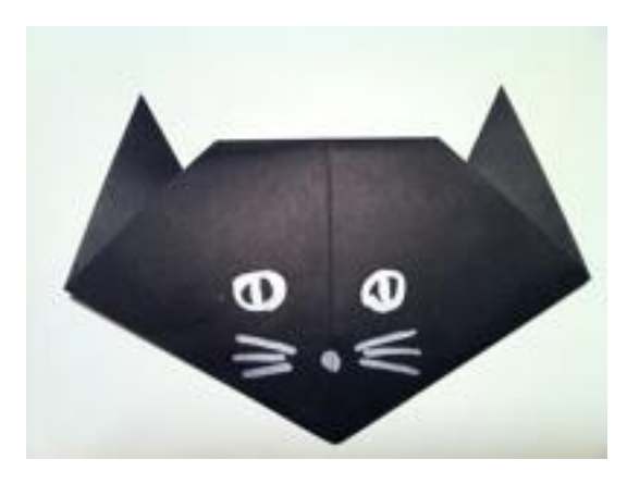
Step 8: Get out some markers and draw in the eyes and whiskers!

Click on "Like" below if you like this origami!