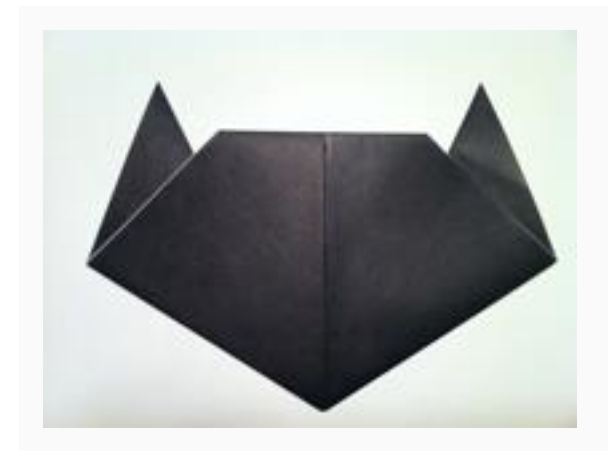
Step 7: Turn the model over.