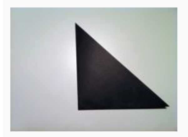
Step 3: Fold in half again by folding left corner to right corner.